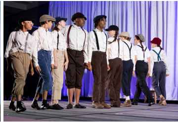
The Miracles (Cape Fear Regional Theatre)