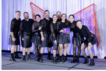
Das Sound Machine