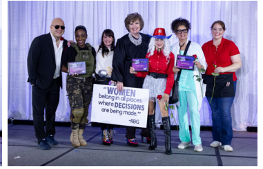
Sequins & Swagger