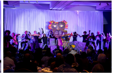
Golden Stars Performance Troupe (E.E. Smith High School)